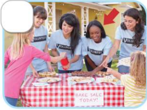
sell homemade cookies