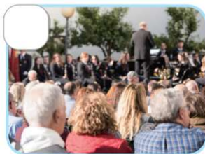
go to a concert