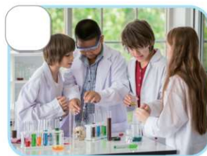
work on their science project