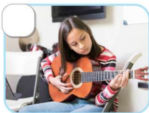
practice the guitar