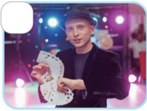
do magic tricks