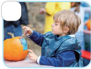
paint a pumpkin