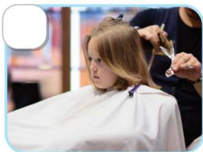
get a haircut