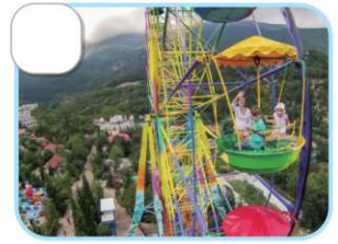
ride the Ferris wheel