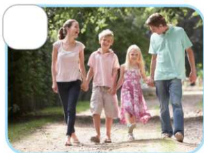
go for a walk