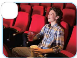
go to the movies