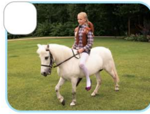
ride a pony