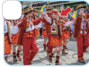
walk in the parade