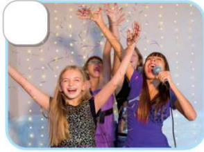
sing at the talent show