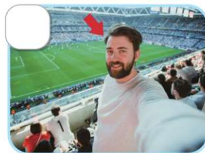
go to a soccer game