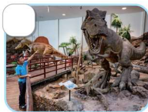
visit a museum